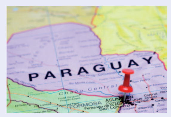
© Dmitry Kaminsky. Further permission required for reuse.

agent, or ATM. This significantly affects their ability to save monetary assets that are readily accessible in times of acute need and emergencies.