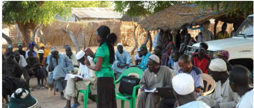
Index insurance training for farmers and cooperatives in Senegal.

The World Bank GIIF Team has been working on increasing levels of awareness, improving technical and commercial capacity, and improving legal and regulatory capacity for index-based insurance in Latin America and the Caribbean, the Pacific and Sub-Saharan Africa. In West Africa, one of the principal recent achievements was the adoption of a new regulation allowing the development of micro-insurance and index insurance in the CIMA zone (covering 14 countries in Francophone West Africa) in April 2012.