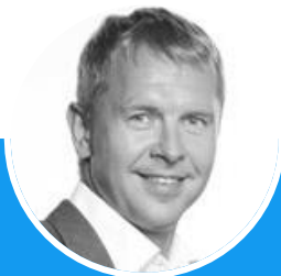
Anatoly Popov Sberbank