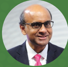
Tharman Shanmugaratnam Senior Minister and Coordinating Minister for Social Policies Government of Singapore