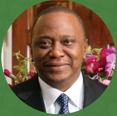
HE Uhuru Kenyatta President of Kenya Government of Kenya