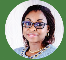
Aurelie Adam Soule Zoumarou Minister of Digital Economy and Communications Government of Benin