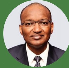
Dr Patrick Njoroge Governor Central Bank of Kenya